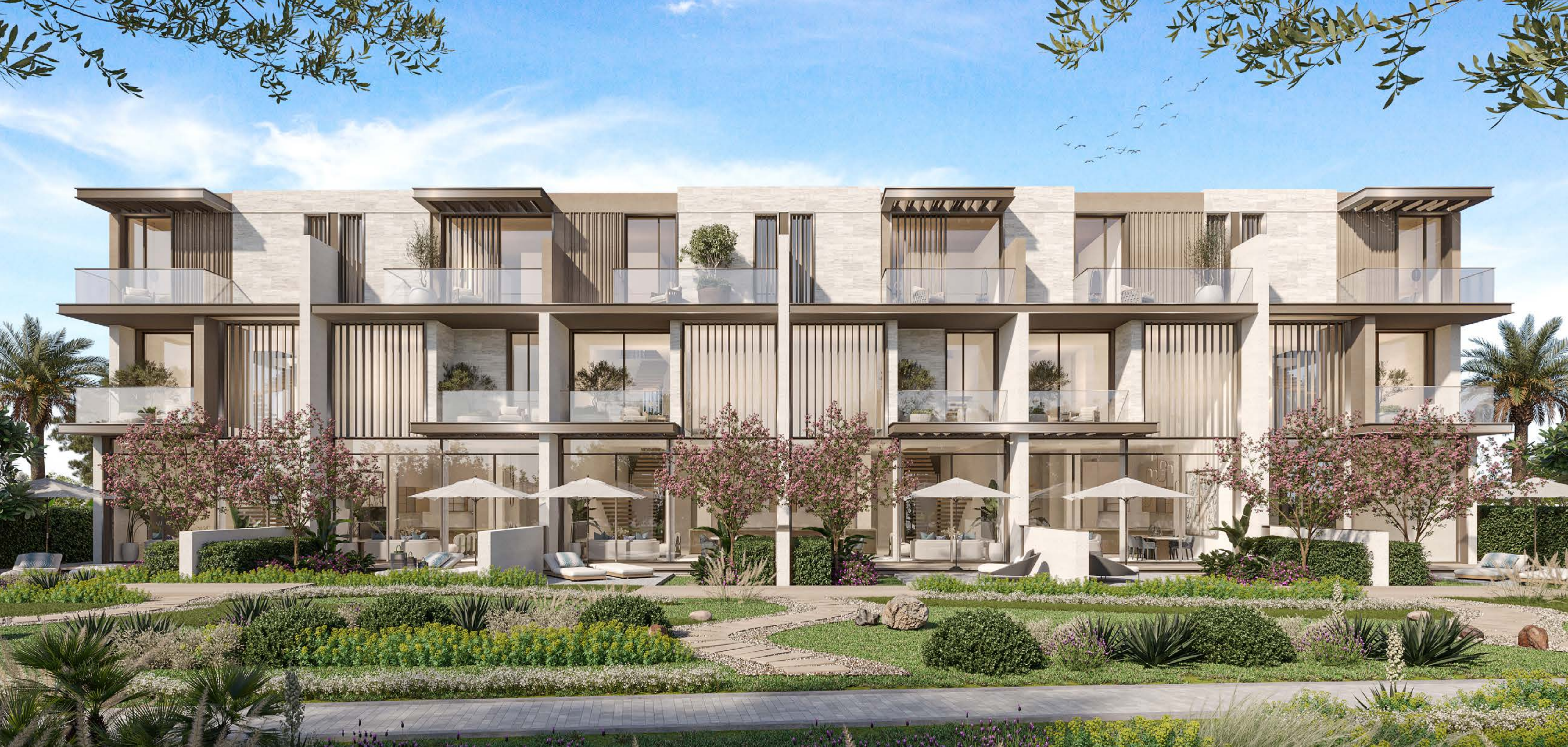
3-BEDROOM TOWNHOUSE | G+2 | 6PLEX