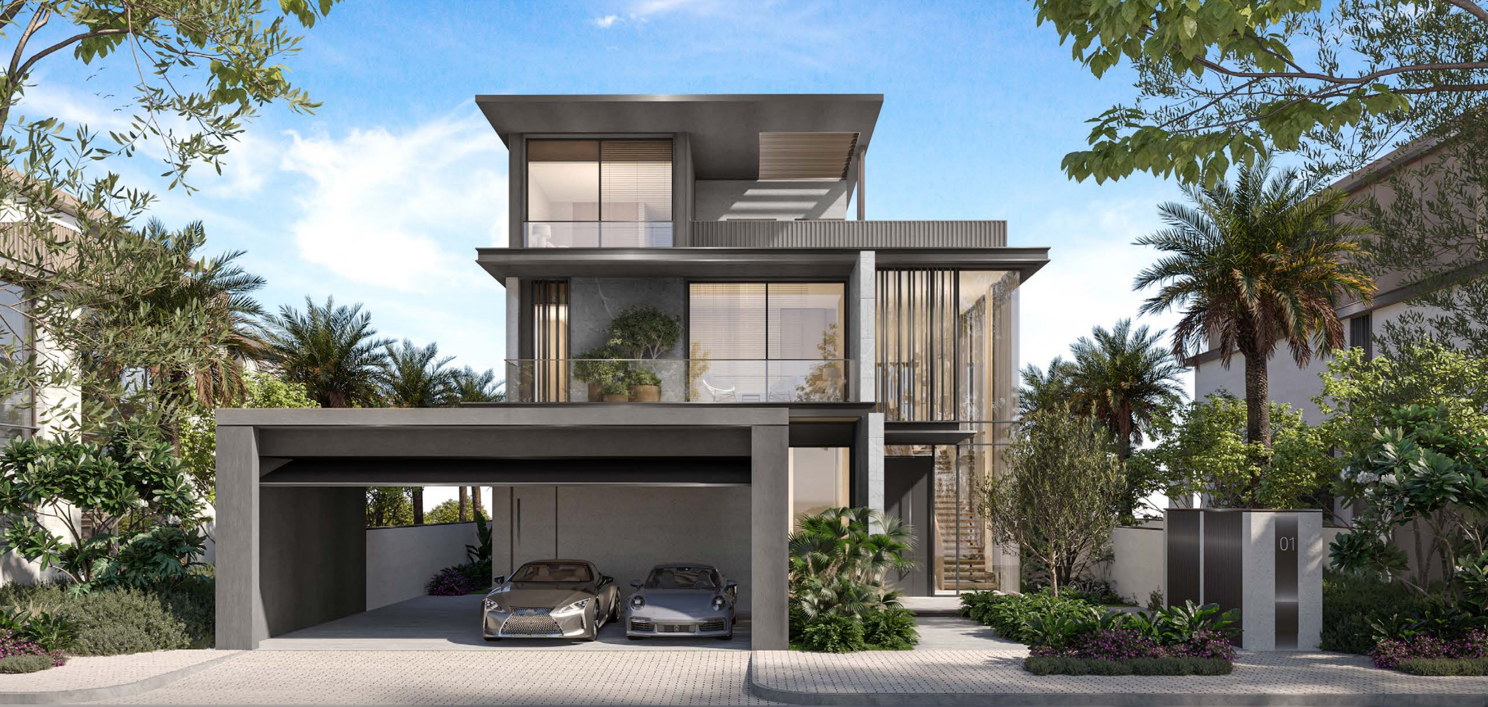
5-BEDROOM VILLA | G+2