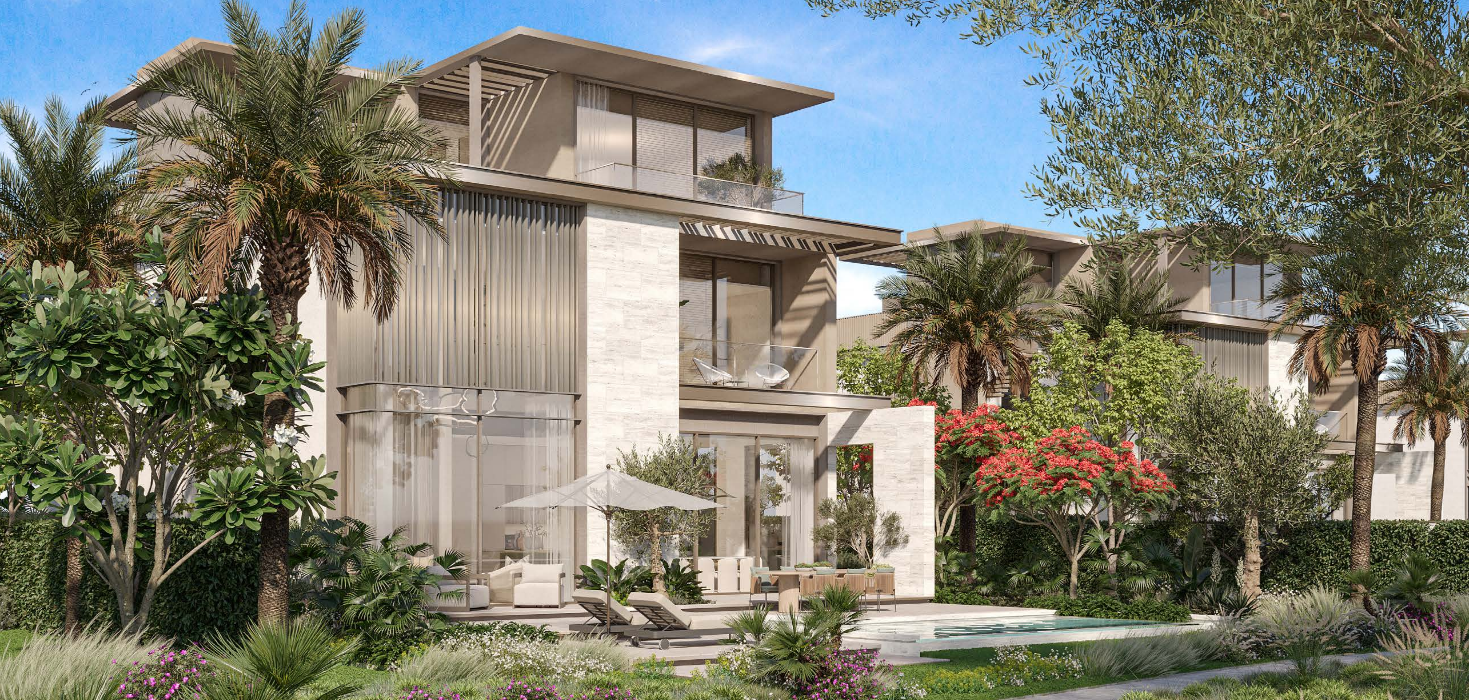
4-BEDROOM VILLA | G+2